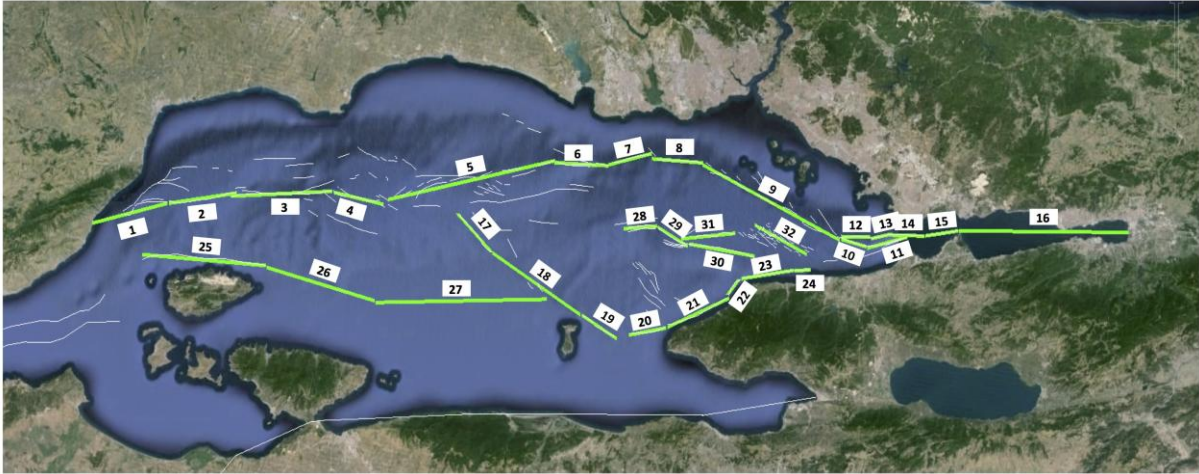
Figure 1: Simplified fault segments in Marmara identified for tsunami modelling. Segments correspond to a rectangular area with an associated uniform slip.

fault, strike, dip, rake, length and width of the segment, focal depth (where the top of the fault has been set to 0.5 km depth), corresponding displacements according to empirical relations provided by Leonard (2010) and Wells and Coppersmith (1994), are provided in Table 1. 30 different scenarios have been identified and described in Table 2.